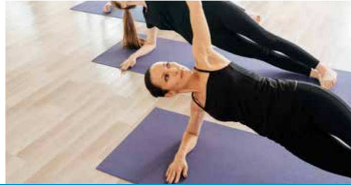
CORE Pilates, Barre, Butts & Gutts