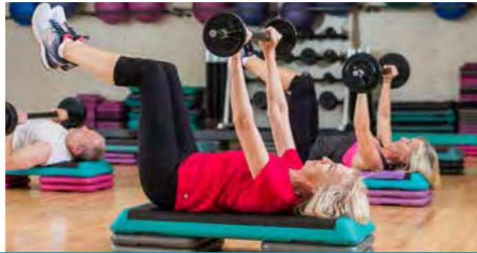
STRENGTH Lift, sTRXngth, Sculpt & Core

Did you know that Trico Centre has the second largest drop-in series in Calgary with over 80 weekly group fitness classes? ALL INCLUDED IN YOUR MEMBERSHIP! ALL IN ONE LOCATION!