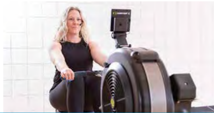
CARDIO Cycling, Step, Zumba®, Rowing