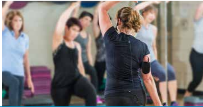
FUNCTIONAL Meta-Bolic, Hip Neutral, #TricoTough