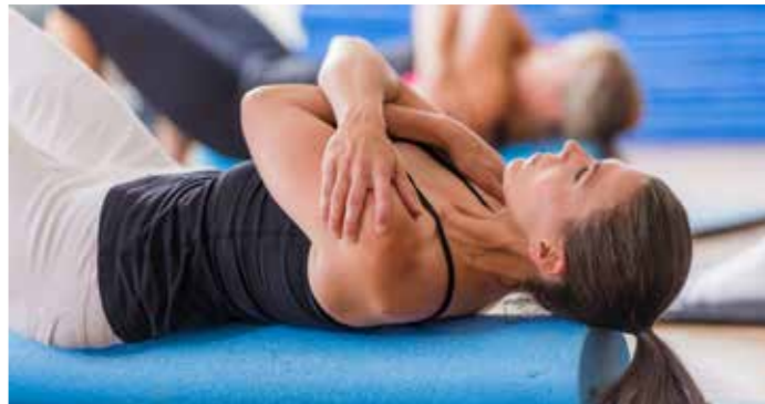
RECOVER Yoga, Bro-ga, Meditation, Roll & Release